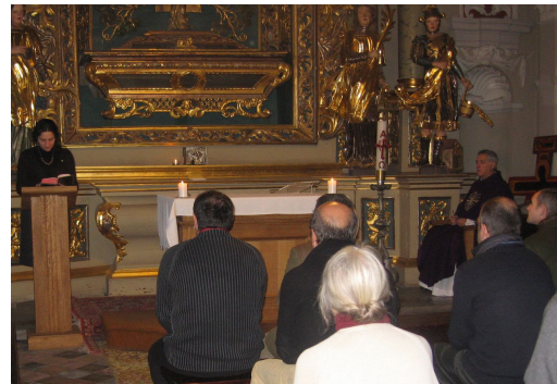
Assembly Mass in Vilnius

3 rd – 5 th August ICMICA Plenary Assembly, Vienna